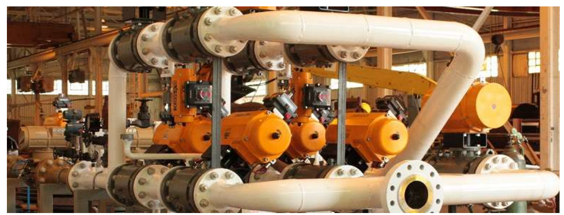
Contact us to find out more or to discuss your specific gas metering requirements.